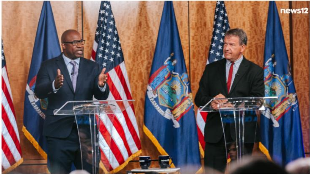
Rep. Jamaal Bowman, left, and challenger George Latimer, right, at a debate in White Plains, New York, May 13, 2024.

( New York Jewish Week ) – In a heated debate Monday night, Rep. Jamaal Bowman attacked his primary challenger, George Latimer, over receiving funding from pro-Israel donors. Bowman also accused Israel of an “onslaught against innocent civilians.”